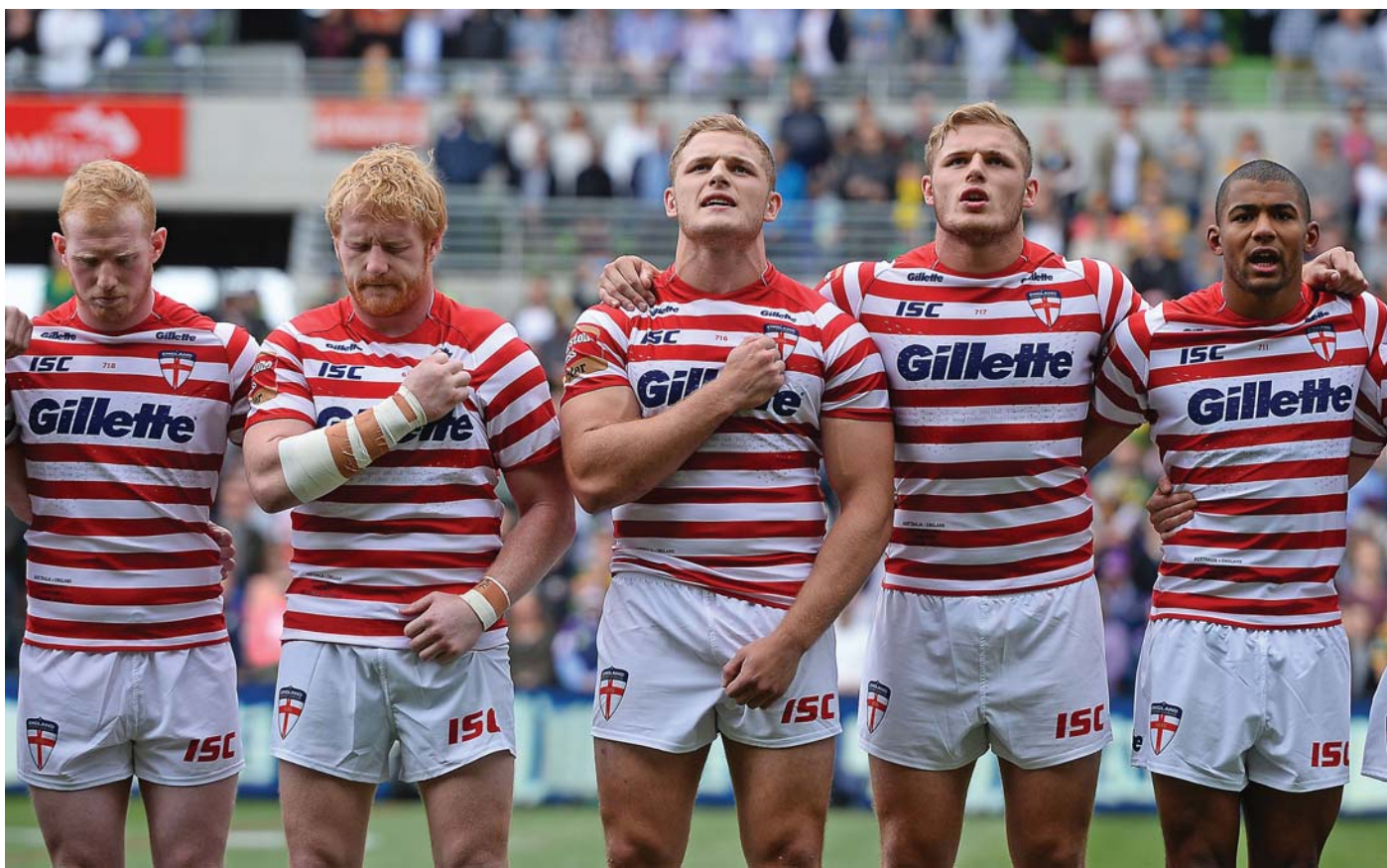
England players during Nation Anthem before the match. Australia vs England, Rugby League - 2014 Four Nations at AAMI Park, Melbourne Australia. Sunday 2 November 2014.