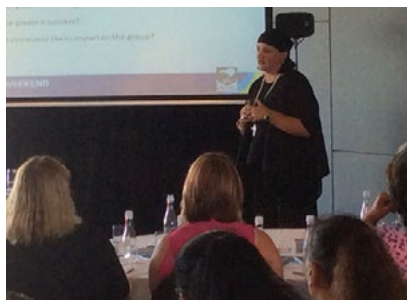
Raelene Castle addresses the Women In League Workshop.

"In reality, I couldn't have done this job without that commercial background," she says. "When you combine that CV and business experience with my love and respect for league, and my understanding of the people and culture, I feel like I've come home."