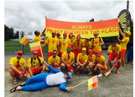
"Always party between the flags". These guys sure did!