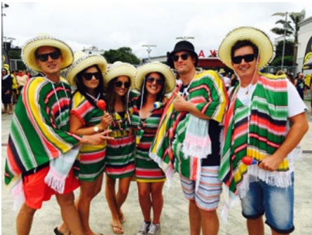
Did these guys start the Mexican wave?