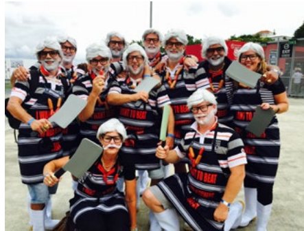
Everyone of these lookalikes is outstanding.