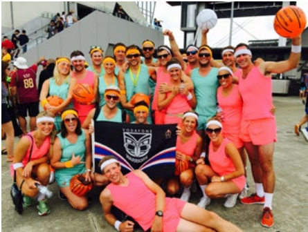
Some Warriors supporters dressed as basketball players.