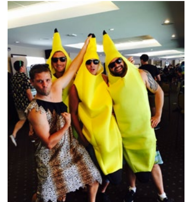
Three bananas and a caveman all having a great time.