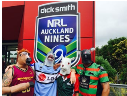
Look at these party animals.