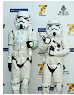
Best Junior Effort