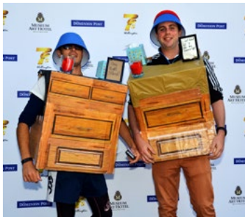
Best Male Group