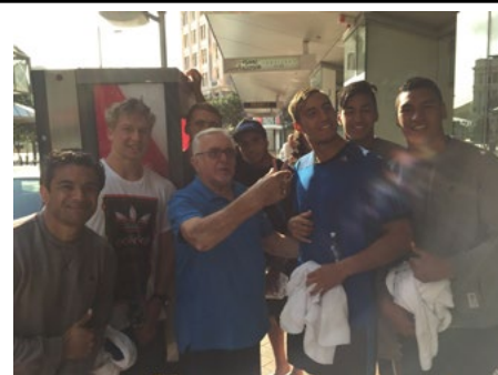
The All Black 7s team.