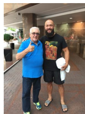
Me and Captain DJ Forbes last Saturday morning in Wellington.

My first duty this week was doing a bit of filming with New Zealand comedian Te Radar for one of his upcoming shows, and there is more to this television lark than meets the eye I can tell you. Then the next day I was filming with Jono & Ben for their upcoming show (now on at 7.30).