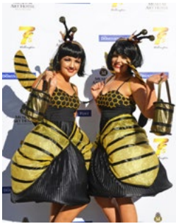
Best Female Group