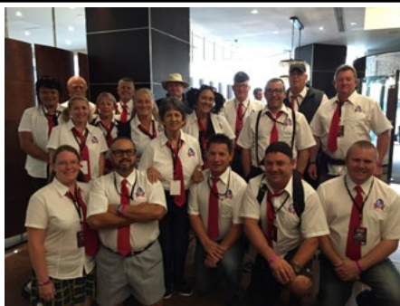
The J.A. RUSSELL Team at the Wellington 7s