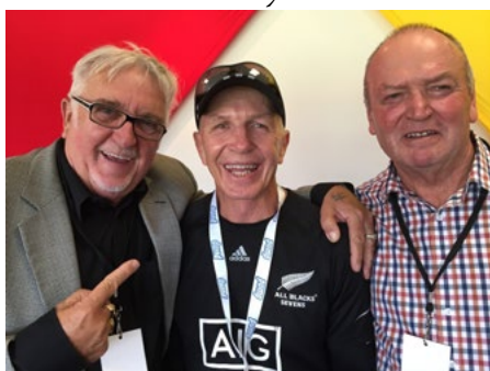
Not every day you get 3 Knights on stage together Sir Peter, Sir Gordon Tietjens coach of the NZ 7s and Sir Graham Henry.