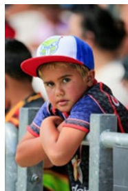
Wonder what he's thinking?