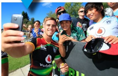
Taking a selfie with the fans.