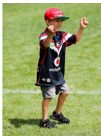
This little man cheering for the Warriors.