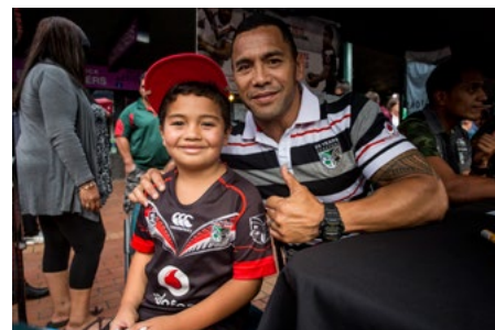
Rugby league legend Ruben Wiki was in big demand in Rotorua.