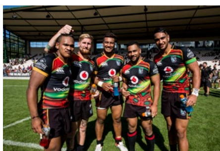
Solomone Kata, Sam Tomkins, Albert Vete, Ngani Laumape and Marata Niukore.