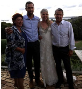
The happy couple with James' Mum and Dad on their big day.