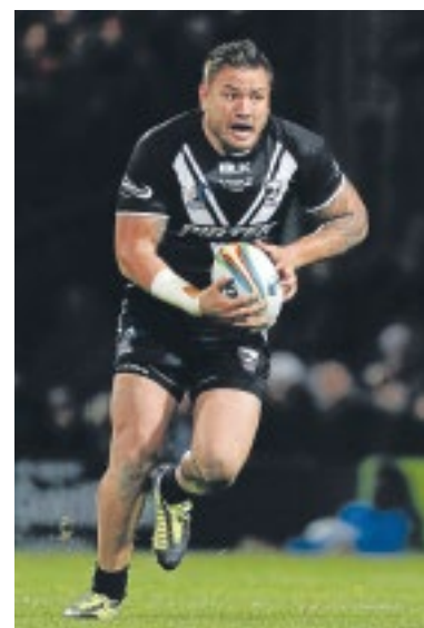
Kiwis enforcer Jared Waerea-Hargreaves missed last year's Four Nations but is expected to be named in the New Zealand squad for May's Anzac test.

"In order to do that they need to perform and be playing well. Players like Elijah Taylor, Roger Tuivasa-Sheck, Jared Waerea-Hargreaves, Ben Matulino, Sam Moa and Sam McKendry as well as Dallin Watene-Zelezniak, who didn't get to the opportunity to play in the Four Nations, are all playing well and that's a positive for us."