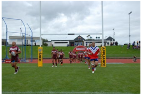
The Otara Scorpions marked their return to the Fox with an opening round loss to Papakura.