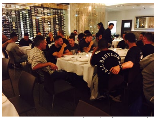
The Kiwis enjoying a meal at the famous Claxton Hotel Brisbane.