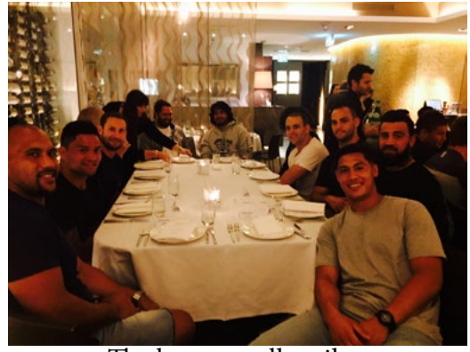
The boys are all smiles.