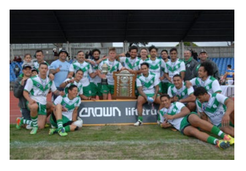
The Pt Chevalier Pirates with the Crown Lift Trucks Stormont Shield.

E often talk about the great game of rugby league but how good is the NRL the governing body in Australia. From each ticket sold $1 will be donated to the RSL in Australia and the RSA in New Zealand. It just keeps on keeping on.