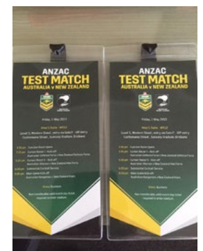
Tickets all sorted for the big game ANZAC test Brisbane this Friday.