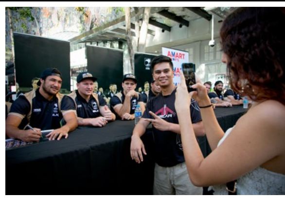
Fan taking a photo with the boys.