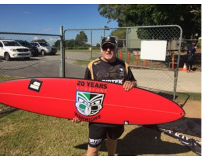
I just had to get a photo with this surf board very nice.