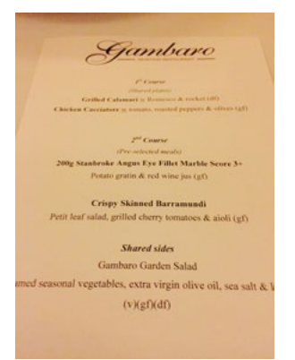
The menu to be enjoyed by all..