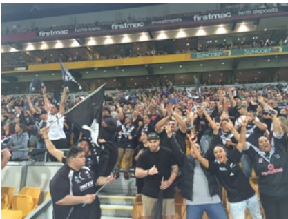
Love the fans they were fantastic.