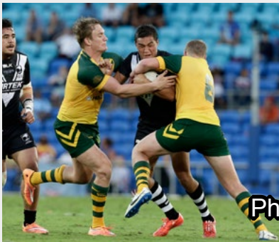
A Junior Kiwi takes on the opposition.

While they were beaten, the Junior Kiwis did us proud and can hold their heads high after such a narrow loss. It very much reminded me of the last time the two sides met, in pouring rain at Mt Smart. That day the Junior Kiwis got up by a single point.