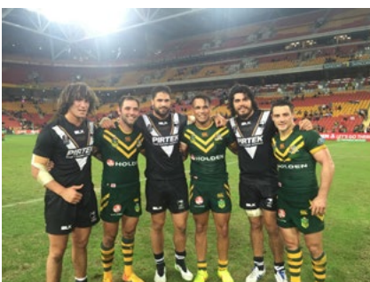
The Storm players all had a chat after the game.