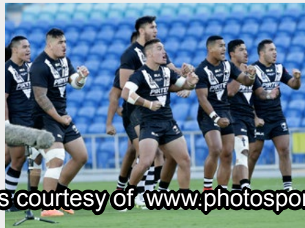
Junior Kiwis team doing the haka.