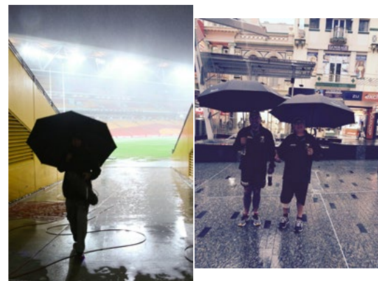
Boy did it rain. Photo Dexter and I under our courtesy of www.photo-sport.co.nz Kiwis umbrellas.

And let's not forget that four people actually died in the storm on Friday night, so it was entirely the right decision.