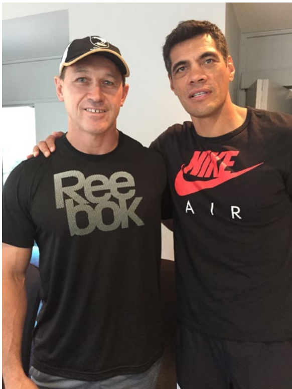
Sean Hoppe with Kiwi Coach & Former Kiwis team mate Stephen Kearney.