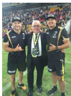
These guys were very happy about the win.