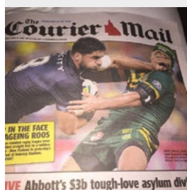
Courier mail frontpage.

The Courier Mail did not hold back, asking if Tim Sheens was the right man to coach Australia, calling him "as popular as 15 minute guitar solos".