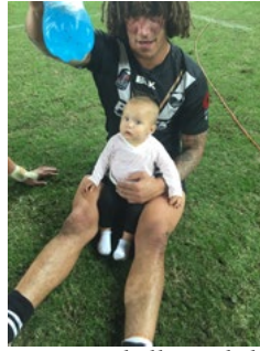
Kevin Proctor chills with his baby after the game.