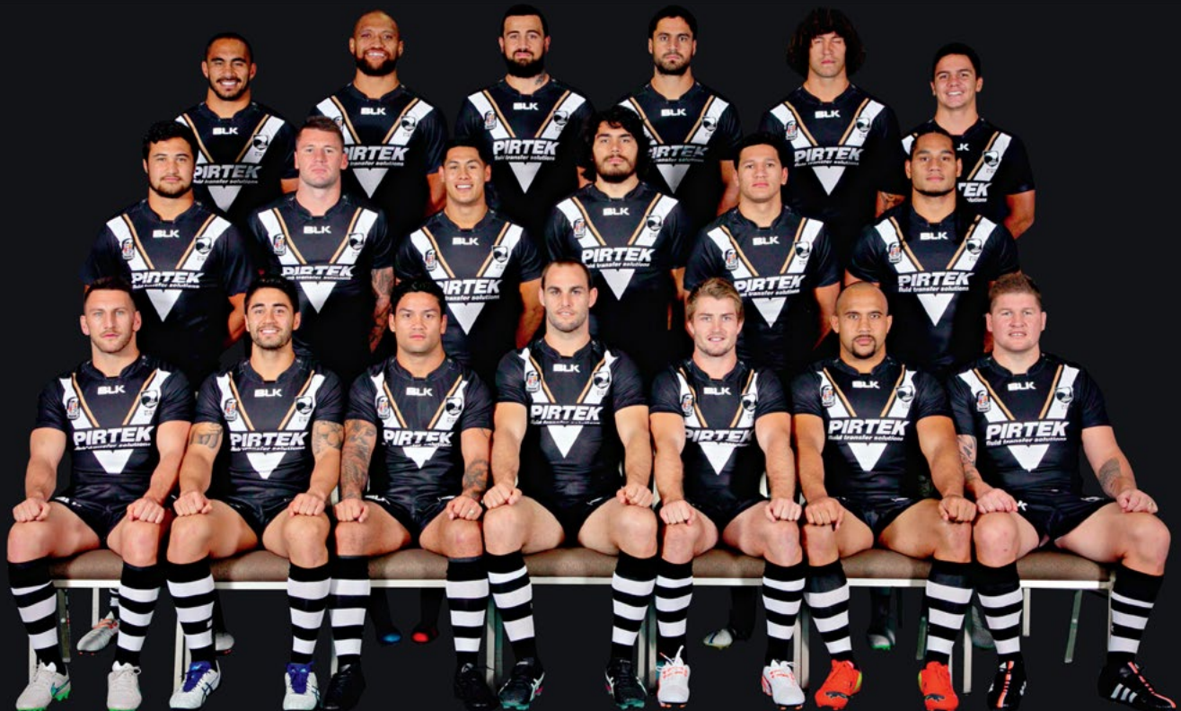
BACK ROW: Thomas Leululi, Manu Vatvei, Ben Matulino, Jesse Bromwich, Kevin Proctor, Kodi Nkoroma. MIDDLE ROW: Peta Hiku, Shaun Kenny-Dowal, Roger Tuvasa-Sheck, Tohu Harris, Dalin Watene-Zelezniak, Martin Taupau. FRONT ROW: Lewis Brown, Shaun Johnson, Issac Luke, Simon Mannering (Captain), Kieran Foran, Sam Moa, Greg Eastwood.