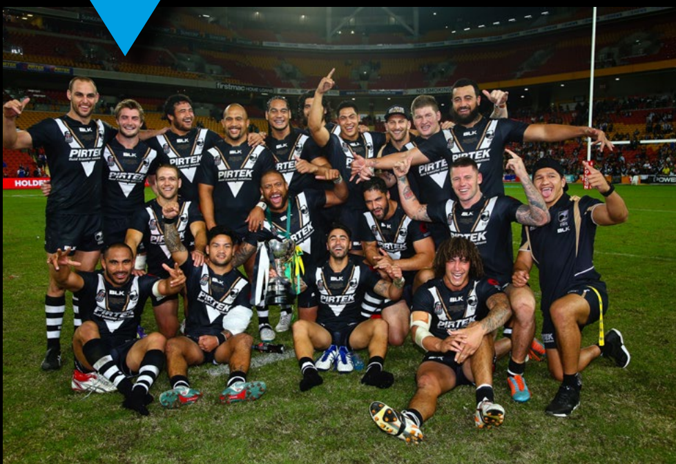
Kiwi boys celebrating their historic win!