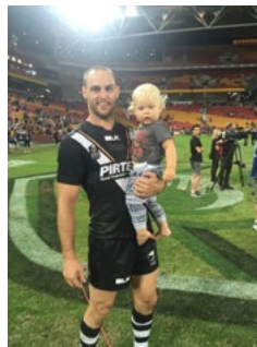
Our captain shares the moment with his son.