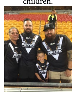
Where would we be without the fans?