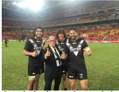
I just had to have a photo with the boys after the game.