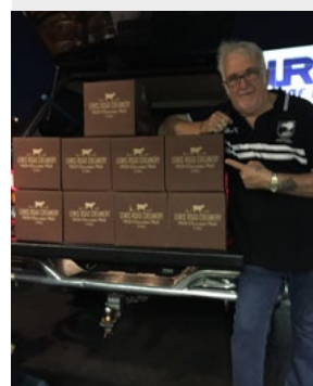
Loading the Lewis Road Creamery milk into the trusty Toyota.

It put a smile on a lot of faces and made the effort well worthwhile.