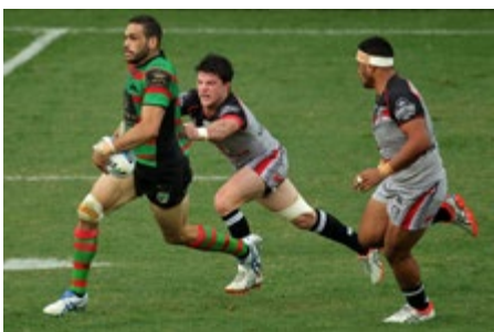
Greg Inglis of the Warriors is chased down by Chad Townsend and Sam Lisone.