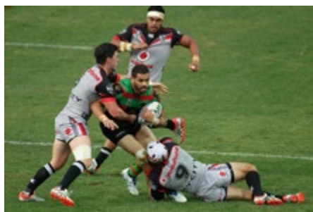
Greg Inglis is tackled by Nathan Friend and Chad Townsend.