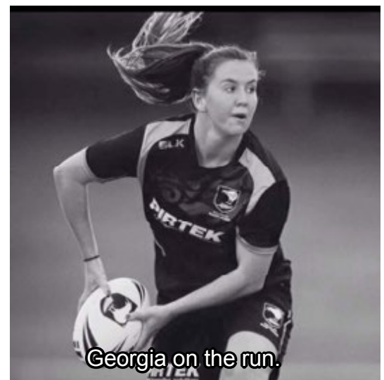
Georgia on the run.