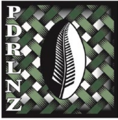
Physical Disability Rugby League New Zealand

Rugby League for physical disabilities Endorsed by NZ Rugby League and Auckland Rugby League