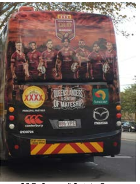
QLD State of Origin Bus.