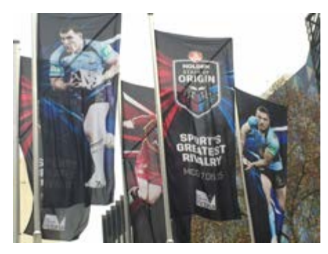
Melbourne is ready for State of Origin.