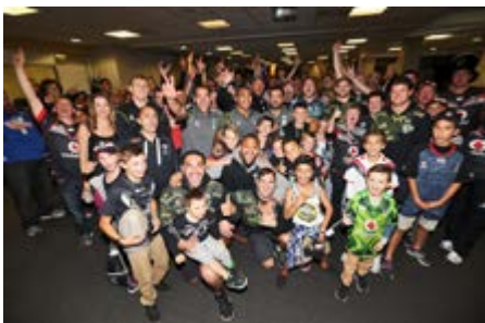
Everyone poses for a photo.