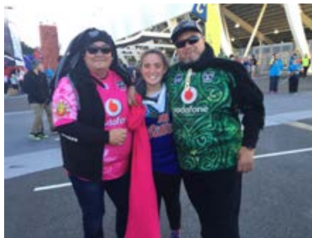
Our fans were out in force at the Titans game.