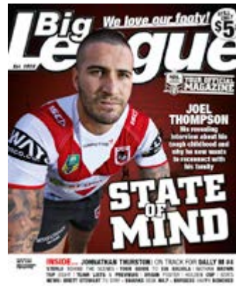
Big League Round 15