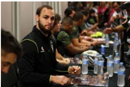
Simon Mannering signing posters for the fans.