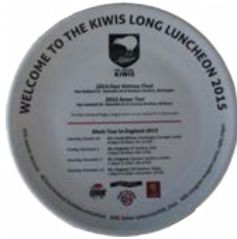
2015 Kiwis Long Luncheon Commemorative Plate