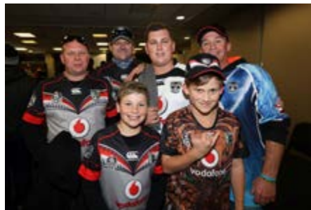
Proud Warriors fans.