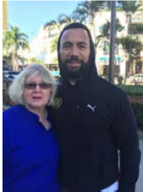
Janice even caught up with the legend Ruben Wiki at Broad Beach.