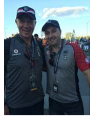
Great to catch up with our loyal fans at the game.