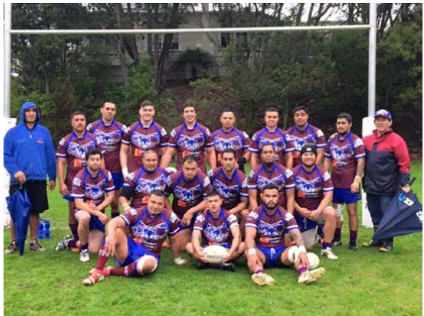
The Richmond Rovers premier team enjoyed a 28-18 win over Ellerslie in Rd 10.

Pt Chevalier v Papakura @ Walker Park – 2.30pm.