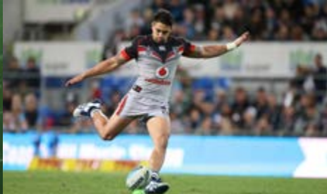
Shaun Johnson converts his try.