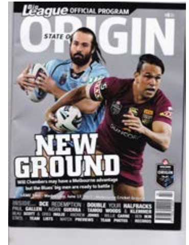
State of Origin Program for Game 2.