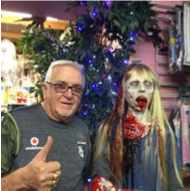
How was this for a date on the Gold Coast.