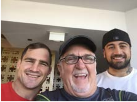
Always great to catch up with the boys.