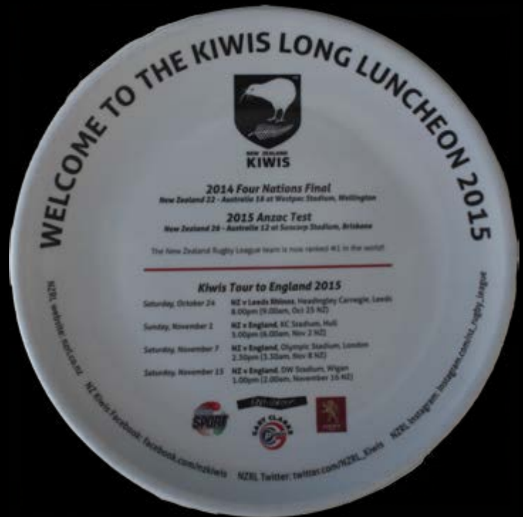
2015 Kiwis Long Luncheon Commemorative Plate