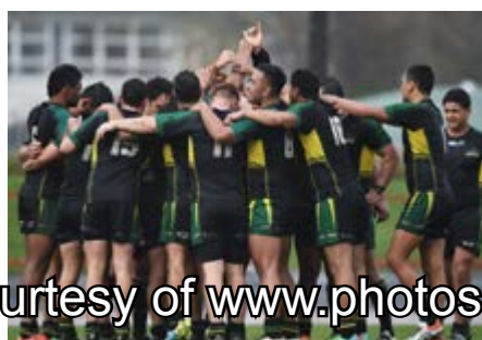
Central players celebrate their win. Central Vipers v Northern Swords.