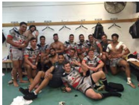
The team chilling out after their loss.