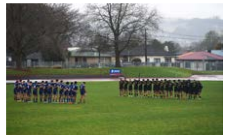
Minutes silence by both teams. Akarana Falcons v Wellington Orcas.