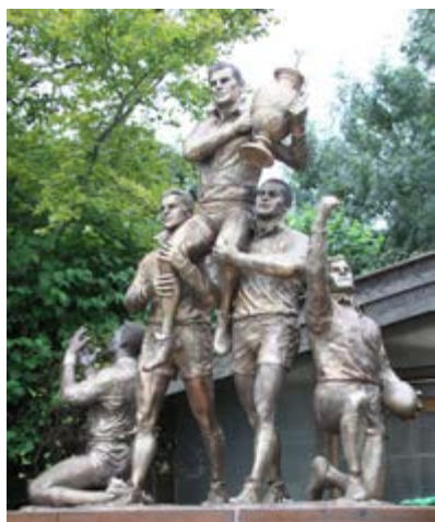
Finished statue outside of Wembley stadium.

Gus Risman, centre, born 1 January 1911, passed away 17 October 1994, aged 83, Tests 17, 9 as captain, 843 games and 4,051 points in his club career of 25 years.