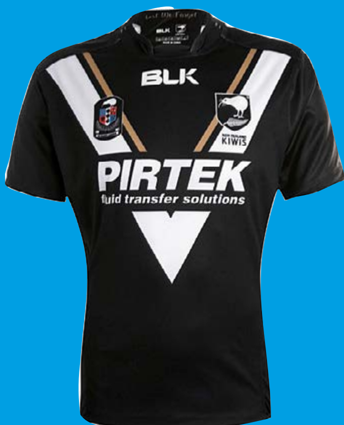
2015 Kiwis Jersey

50 Jerseys to be won! 25 Vodafone Warriors and 25 Kiwis Jerseys.