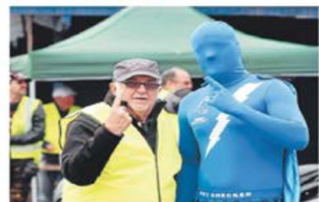
Sir Peter Leitch and the Blue Streak raise awareness about prostate cancer.