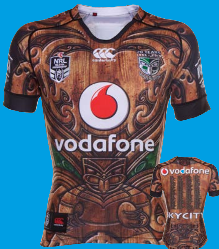
Vodafone Warriors Heritage Jerseys

Greatest Ever Jersey Giveaway P.O Box 54295 The Marina 2144, Manukau, Auckland