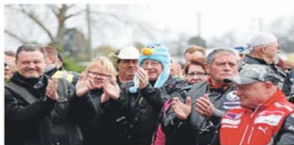
The crowd applaud before beginning the ride.