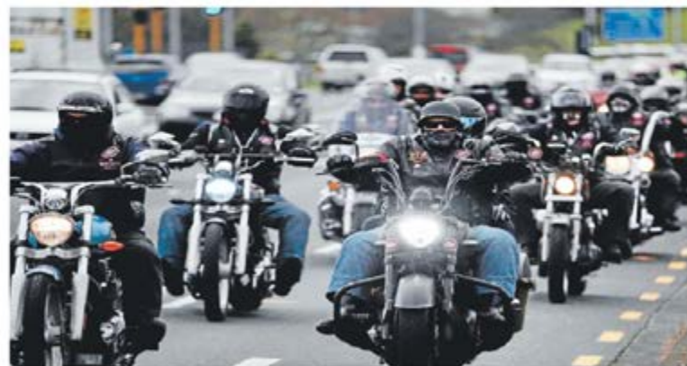
Bikers in Blue set off from Pakuranga to Albany to raise awareness about prostate cancer on Sunday.

There was a sea of blue at Placemakers Pakuranga early on Sunday morning. The Bikers in Blue event saw hundreds of riders leave East Auckland at 8am for Placemakers Albany to help promote prostate cancer awareness campaign Blue September. Sir Peter Leitch waved the riders off at the start of their journey after giving them an encouraging send-off.