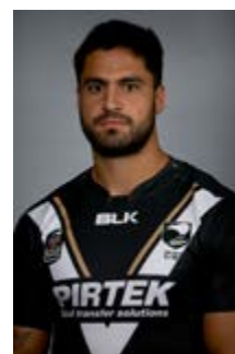
Jesse Bromwich (Storm) 26, 14 Tests, 132 NRL games