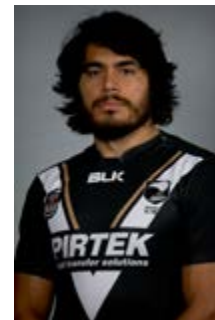
Tohu Harris (Storm) 23, 7 Tests, 76 NRL games