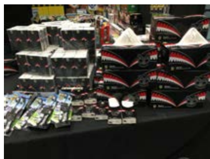
Vodafone Warriors fans these products are coming your way soon pocket tissues, tissue boxes and tooth brushes.