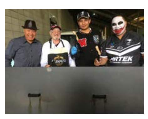
And a big thanks to my great helpers on the BBQ WHO NEVER STOPPED ALL DAY JOB WELL DONE TEAM THANK YOU.