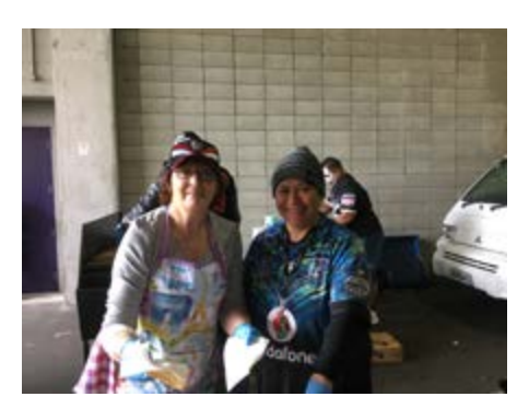
My wonderful helpers.