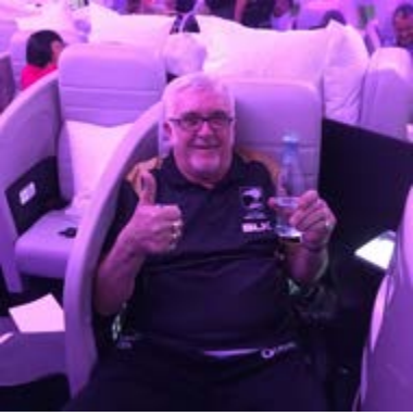
Me on the plane.