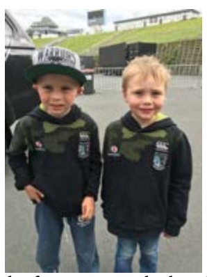
And the fans came in the hundreds even these two young men.