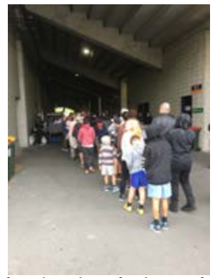
The fans lined up for hours for the Mad Butcher BBQ.