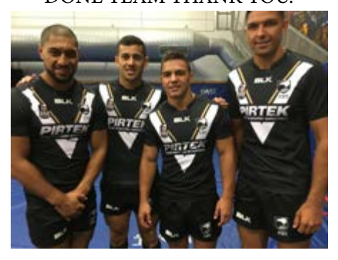
These guys can't wait to get on the field to make earn there first Kiwis jersey.