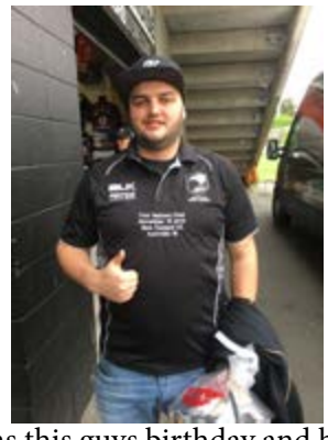
It's was this guys birthday and he told me the best birthday present he got was watching the Kiwis train and the free BBQ ON THE DAY.