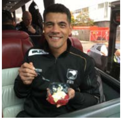
The coach chilling out on our Pitt stop on the four hour drive to Leeds.