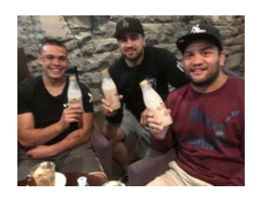
The boys love their Lewis Road Creamery milk..