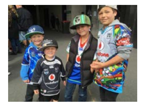
The fans support was fantastic these guys had a ball and a sausage or two on the day.