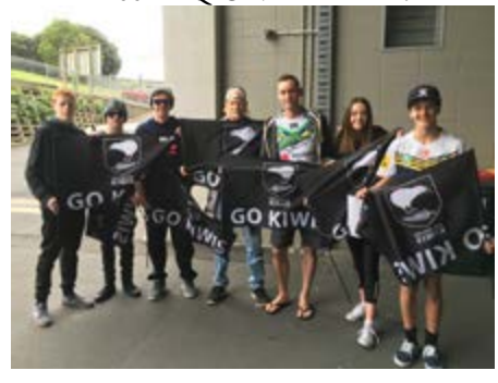
The fans loved the kiwi flags I was giving away FREE ON SUNDAY.