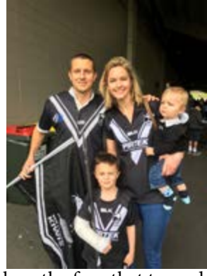
I just love the fans that turned up on Sunday and THANK YOU ALL FOR GOING TO WATCH THE KIWIS TRAIN LIKE THIS WHOLE FAM-