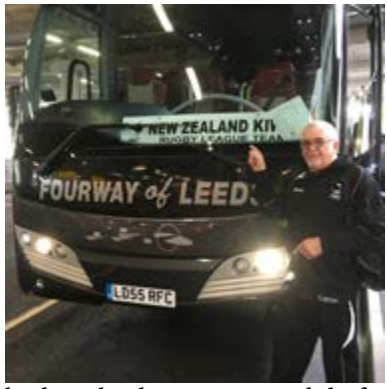
I had to check out our coach before we hoped on for the 4 drive to Leeds.