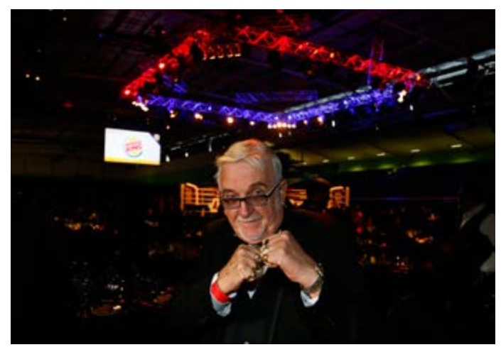
I'm ready to rumble.